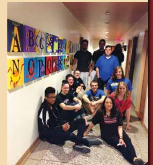
Harmony Project installation brightens CCI Family Floor thanks to Cardinal Stritch University students.