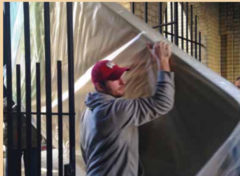
New mattresses kick-off shelter "make-over" efforts.