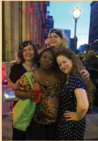
CityCenter's Celebration of the Century honored women by supporting CCI's mission.