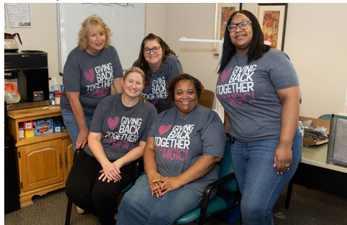
MGIC volunteers helping clean and organize our Emergency Shelter before the return of guests after the storm damage repairs.

As we reflect on the close of another year at Cathedral Center, one truth rises above all others: our strength is found in collaboration. Every step forward we made this year was powered by the collective compassion of our supporters, volunteers, donors, and community partners who stood with women and families on their journeys toward stability.