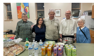
Thank you to all of our Hospitality Groups! (Pictured: Cathedral of St. John The Evangelist Hospitality Group)

Thank you for being part of Cathedral Center's community and for supporting our work that encourages women and families to understand the dignity that is present in every milestone, setback, and small step forward. Your generosity and willingness to carry out our mission has made these early days of 2026 that much more impactful. We can't wait to see where the rest of the year takes us.