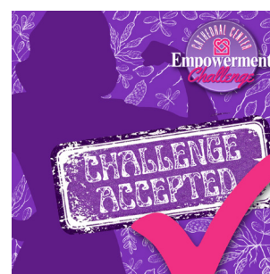
Thank you to everyone who accepted the challenge and helped make our Empowerment Challenge a success!

together to make our 2026 Empowerment Challenge a success! With the intention of highlighting and supporting our services that empower women and families and help women create and achieve goals that lead them on a journey of transformation, the Empowerment Challenge showcases that dignity is not reserved for any one way of life.